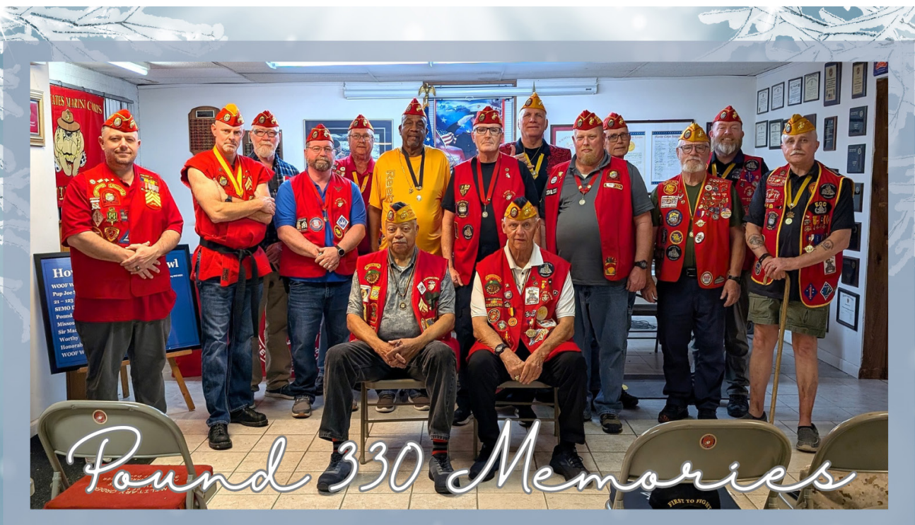
SEMO Devil Dogs Pound 330. Cape Girardeau, Missouri. 18 November 2025.